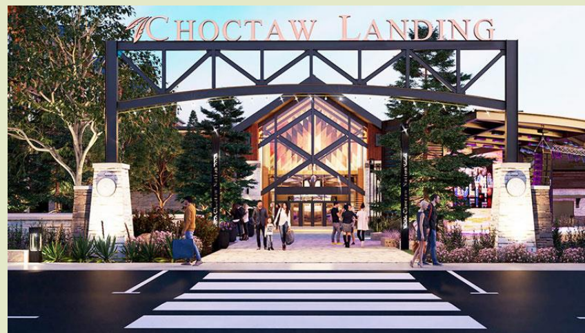
Choctaw Landing, OK