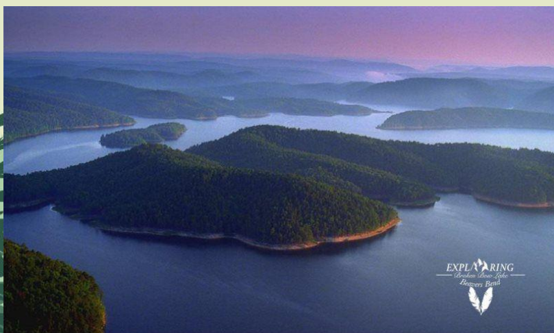
Broken Bow Lake, OK