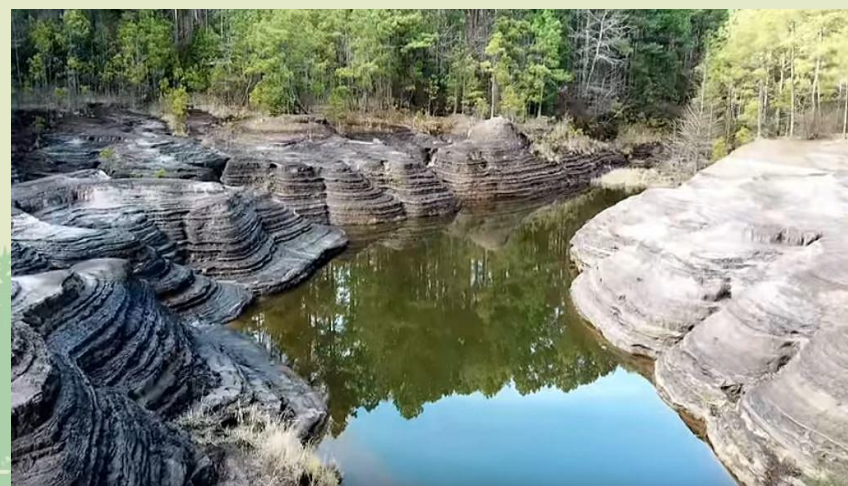
Ouachita Mountains, AR