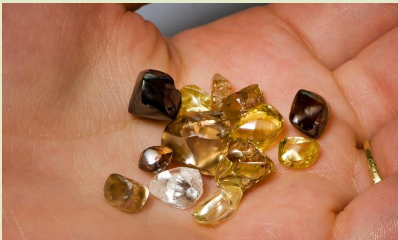
Crater of Diamonds, AR